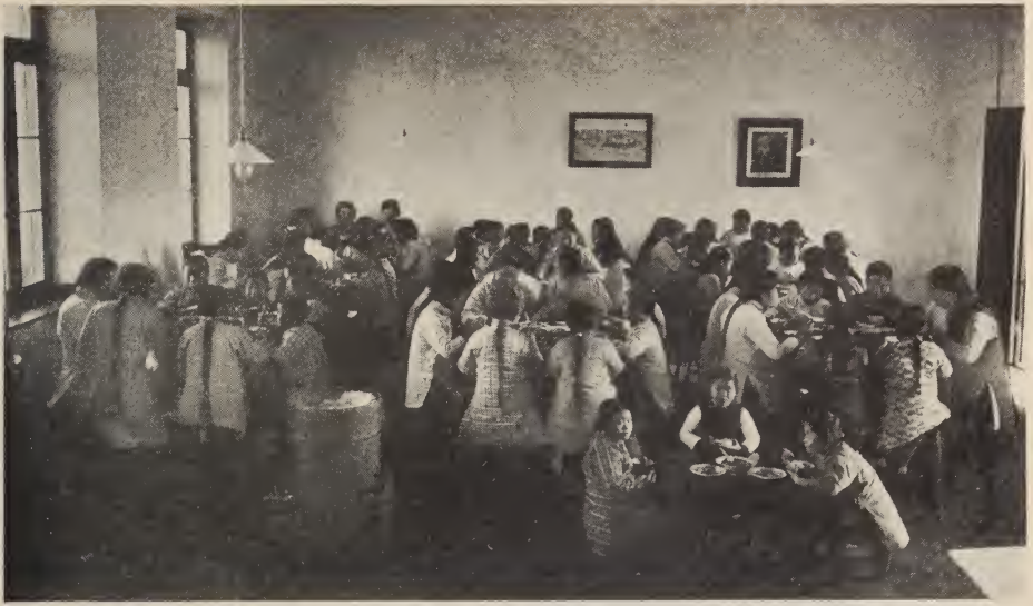
NOON-DAY RICE AT SAINT AGNES'S